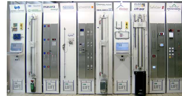
CANopen-Lift-Demonstrator am CiA-Stand 5119