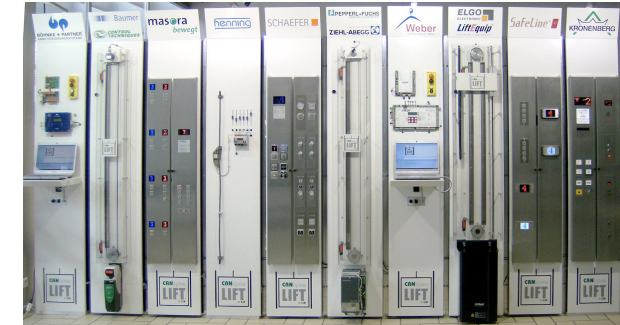
CANopen-Lift-Demonstrator am CiA-Stand 5119